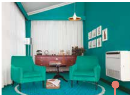
From top to bottom: ceiling-cassette, wall-mounted, and floor-mounted units